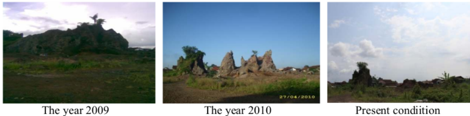
Figure 1. Development of Ten Thousand Hills Damage Level

hills extinction rate is increasing. Figure 1 presents the damage level of a hill part of Bukit Ten Thousand.