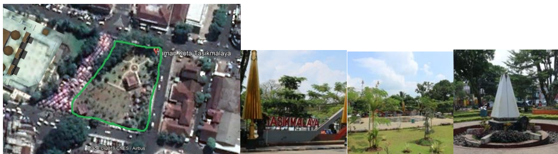
Figure 3. City Park Green Open Space

City Park Green Open Space is located in the center of the city which is opposite the Great Mosque of the City of Tasikmalaya located on Jl. K.H.Z Mustofa which has a land area of \pm 0.44 Ha. This city park has such an attractive beauty and has always been a favorite city park for residents because it is located in the heart of Tasikmalaya City. Inaugurated at the end of 2016.