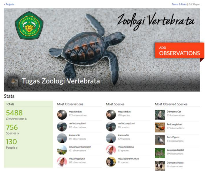
Figure 1. Project "Tugas Zoologi Vertebrata" created by using the iNaturalist platform.

The collected iNaturalist Data is made with the traditional projects found on the iNaturalist platform. Then, prospective biology teachers can collect data and store it in the data. For the process of uploading the data can be done in a moment or done later. The following are project drawings created using the iNaturalist platform.