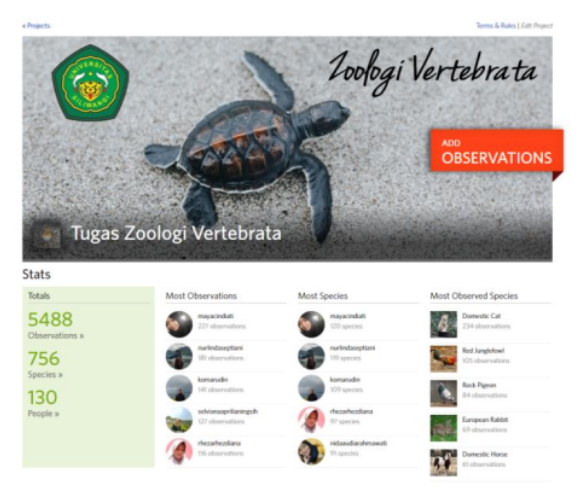
Figure 1. Project "Tugas Zoologi Vertebrata" created by using the iNaturalist platform.

The collected iNaturalist data is made with the traditional projects found on the iNaturalist platform. Then, prospective biology teachers can collect data and store it in the data. For the process of uploading the data can be done in a moment or done later. The following is project drawings created using the iNaturalist platform.