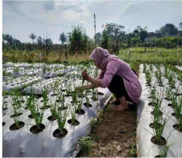
Figure 2. Height measurement of sample

laboratory testing, organic chicken fertilizer has a more significant nitrogen concentration than duck and quail organic fertilizer. This amount causes the plant to replicate cells more quickly, allowing it to grow taller. Nitrogen is a fundamental macro element that is a critical component of various chemicals found in plants. The effect of N in increasing the pace of plant growth is linked to the increased development of shallots. According to Napitupulu and Winarto [17], N fertilizer application significantly impacts plant height increase. Plants require elements of N, P, and K, according to Puspawati et al. [18], notably in encouraging plant height growth. When the onion plants were 42 DAP, the treatment of organic chicken fertilizer was significantly different from the other treatments (Figure 2).