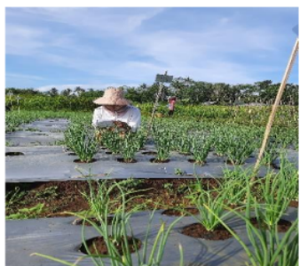
Figure 3. Number of leave measurement of sample

the onion plant's needs will optimize growth.