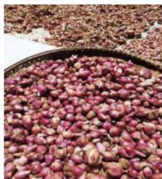
Figure 8. Dry weight of shallots per hectare of measurement

According to statistical research, there is an interaction between the type and dose of organic poultry manure and the dry weight of shallots per hectare (Table 9). Meanwhile, the dry weight of shallots per acre was significantly different from poultry dung organic fertilizer treatment (Figure 8). The quail organic fertilizer treatment did not differ considerably from the dose of organic fertilizer. Treatment doses of up to 15 t ha -1 of organic fertilizer were not substantially different from the type of organic fertilizer. Organic fertilizers can stimulate a variety of soil organisms, allowing them to release phytohormones and encourage plant development [32]. Compared to other treatments, the organic fertilizer type and dose of 10 t ha -1 resulted in the heaviest dry weight of shallots per plot in the chicken treatment (Table 9). It is because chicken organic fertilizers include more N, P, and K than other organic fertilizers. According to Napitupulu and Winarto [17], the combination of N and K causes shallots to have a high dry weight. Potassium aids the photosynthetic process, namely the creation of organic molecules stored in storage organs, such as tubers, according to Tränkner et al. [33]. When the correct amount of organic fertilizer is applied to shallot bulbs, production rises [34].