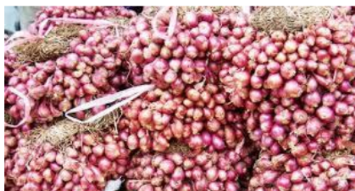
Figure 7. Dry weight of shallots per clump of measurement

Plant dry weight is the total amount of carbohydrates available for growth throughout a plant's life [31]. Can use the dry weight of organic fertilizer to estimate how much is absorbed by plants in the form of minerals. Compared to ducks and quails, the organic fertilizer treatment of chicken species resulted in the highest dry weight of shallots per clump. Organic chicken fertilizer has a higher nutrient content of N, P, and K than ducks and quails, absorbing more nutrients. On the dry weight of shallots per plant, a dose of organic fertilizer of up to 15 t ha -1 is optimum (Figure 7). The plant can develop optimally at this dose, resulting in maximum dry weight.