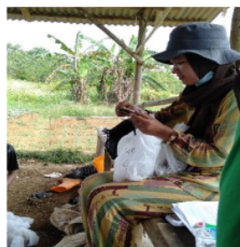
Figure 4. Number of tubers measurement of sample

genetic factors. The variety significantly affects the yield of shallot bulbs [27]. According to Azmi and Wiguna [28], forming shallots requires a more extended number of days. onion bulbs will continue growing and developing new tillers when the minimum day length limit is reached. Independently, the dose treatment of organic fertilizer as much as 15 t ha -1 produced the highest number of tubers compared to other treatments (Figure 4). Giving organic fertilizer to the soil causes the soil to become loose, making it easier for plants to form more tubers.