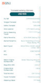
Paymnet Proof.jpeg 97K