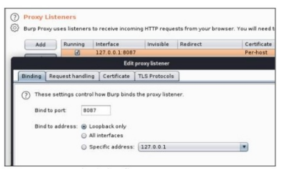
Fig 5. Configure Burp Proxy

This is done with a proxy configuration on Burp, this is useful for receiving HTTP requests that come from a web browser. Figure 5 shows a proxy listener with the default ip along with port 8087 has been added.