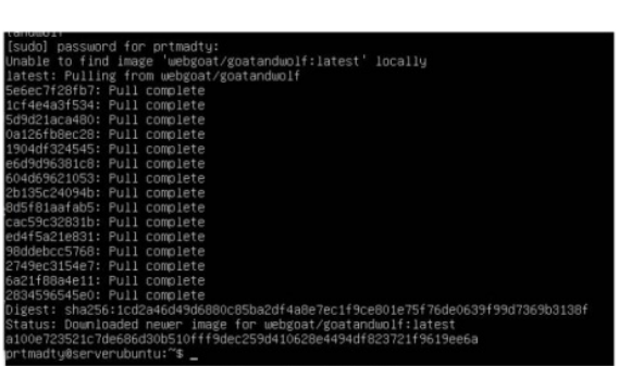
Fig 3. Installing WebGoat

At this stage, the results of the WebGoat download process from the repository are finished as shown in Figure 3.