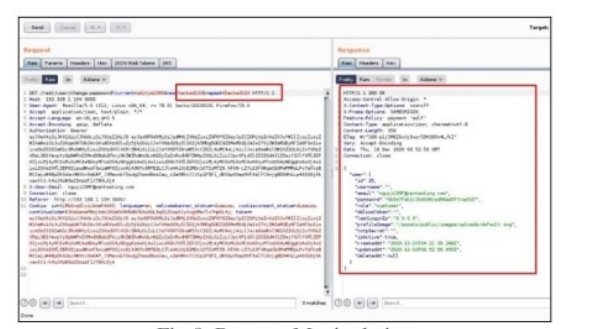
Fig 8. Request Manipulation

The real user unknowingly sent an HTTP request that was forged by the attacker, the server responds with "200 OK status" that means the server correctly validates the fake request that has been sent, can be seen in Figure 8. The server cannot identify the forgery because the request was made by the user which is authenticated and sends all necessary data.