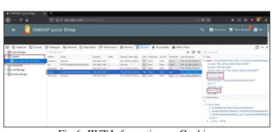
Fig 6. JWT Information on Cookies

At this stage, the intercepted GET request parameter is displayed when the client updates the password. Fig 7 shows the request sent to the server including a valid API token, so the server responds with a success status.