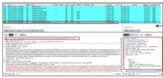
Fig 7. Intercept GET request

At this stage, the intercepted GET request parameter is displayed when the client updates the password. Fig 7 shows the request sent to the server including a valid API token, so the server responds with a success status.