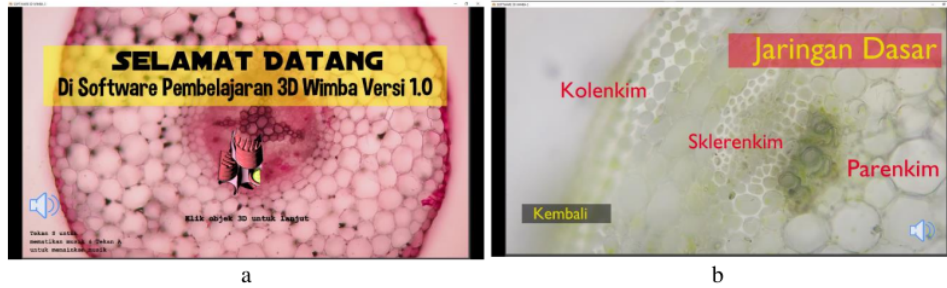
Figure 1. Opening menu form (a) and layout menu (b) of 3D Wimba

Figure 1 and 2 depicts the developed interactive animated 3D media using Wimba.