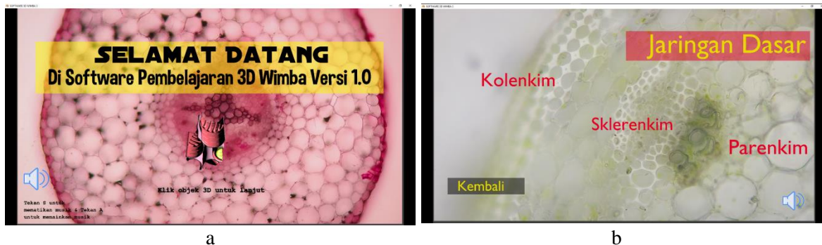
Figure 1. Opening menu form (a) and layout menu (b) of 3D Wimba

Figure 1 and 2 depicts the developed interactive animated 3D media using Wimba.