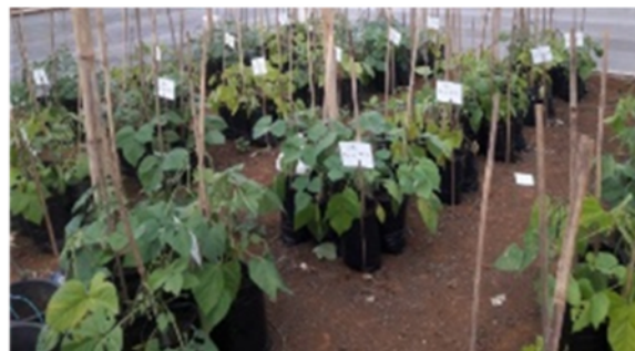
Fig. 1. Vegetative performance of mungbean.

mangosteen parts, aril, pericarp and other components are utilised (Kaur et al., 2020). The main bioactive compounds contained in the skin and aril are xanthone derivatives (Murthy et al., 2018). Xanthone, a secondary metabolite, has long been known as an antioxidant (Gondokesuma et al., 2019; Ibrahim et al., 2016; Murthy et al., 2018). Xanthone is an anti-inflammatory, anti-allergic, anti-cancer, anti-microbial, anti-parasitic and anti-bacterial agent (Ibrahim et al., 2016; Murthy et al., 2018). The main component of mangosteen pericarp extract shows high antioxidant activity and remarkably reduces oxidative damage to blood proteins because of its ability to neutralise ROS (Suthamarak et al., 2016). Silva et al. (2016) also found that mangosteen pericarp extract is effective as an antioxidant and protects DNA from free radical damage. Detection of DNA using electrochemical biosensors have been developed to get fast and accurate information about plant diseases (Low et al., 2017).