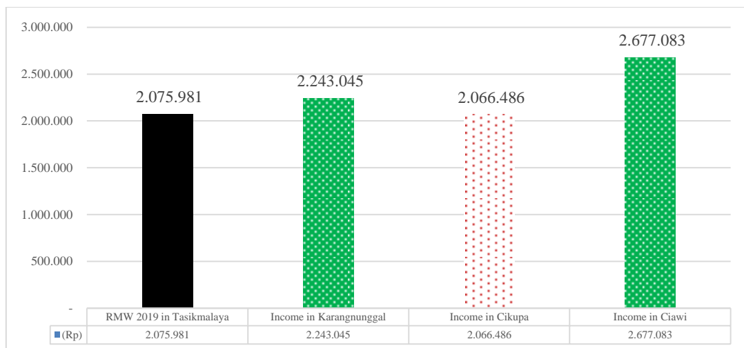
Figure 1. Comparison of IPPF Household Income with RMW of Tasikmalaya Regency in 2019

There are two sources of IPPF income. They are income from Integrated Plantation of Polyculture (IPP) itself and income from outside IPP (another business). The average of the total income of IPPF in one year in Cikupa Village, Ciawi Village, and Karangnunggal District are Rp. 24,797,837, Rp. 32,125,000 and Rp. 26,916,535 or equivalent to Rp. 2,066,486, Rp. 2,677,083 and Rp. 2,243,045 per month. Compared to the Regional Minimum Wage (RMW) of Tasikmalaya Regency in 2019 of Rp. 2,075,189 per month, IPP farmers in Cikupa Village have lower total income than RMW, but farmers in Ciawi Village and Karangnunggal District have a total income that exceeds RMW.