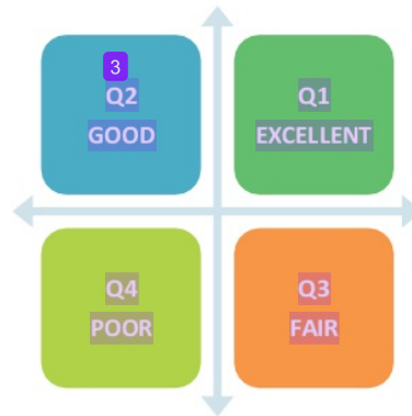
Figure 1 Maslahah-Efficiency Quadrant (MEQ)

Having efficiency and masalah analysis in one basket, therefore, the analysis framework of this study will be referring to the following figure 2 of quadrant: