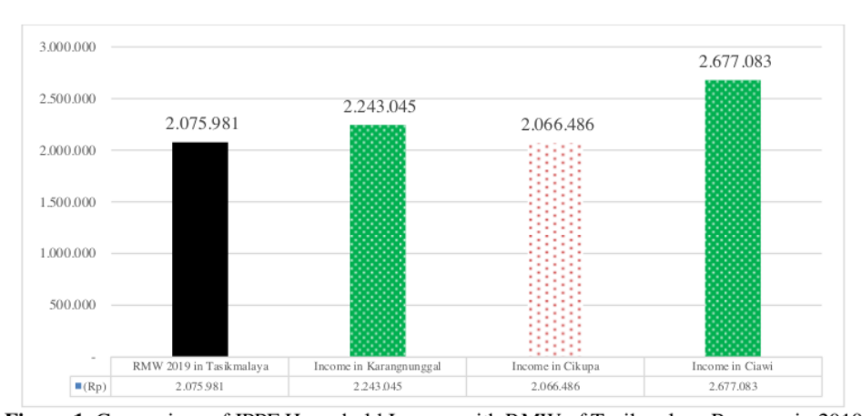
Figure 1. Comparison of IPPF Household Income with RMW of Tasikmalaya Regency in 2019

There are two sources of IPPF income. They are income from Integrated Plantation of Polyculture (IPP) itself and income from outside IPP (another business). The average of the total income of IPPF in one year in Cikupa Village, Ciawi Village, and Karangnunggal District are Rp. 24,797,837, Rp. 32,125,000 and Rp. 26,916,535 or equivalent to Rp. 2,066,486, Rp. 2,677,083 and Rp. 2,243,045 per month. Compared to the Regional Minimum Wage (RMW) of Tasikmalaya Regency in 2019 of Rp. 2,075,189 per month, IPP farmers in Cikupa Village have lower total income than RMW, but farmers in Ciawi Village and Karangnunggal District have a total income that exceeds RMW.